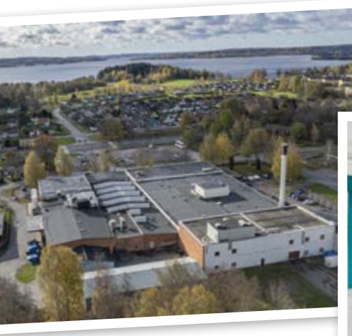
Cell Impact's production facility in Karlskoga.

In the production facility in Karlskoga, the construction of a total of 3 to 4 production lines, suitable for both high and low volume production corresponding to 18 to 20 million flow plates per year, is expected to be completed sometime between 2025 and 2027. Given the Company's current assessment of price levels and revenue mix, this capacity is estimated to correspond to an annual sales potential of approximately MSEK 800. The goal is to create the conditions necessary to raise Cell Impact's EBITDA margin to a level that is significantly higher than the Company's stated financial targets in the medium term through highly automated production in combination with a large pool of expertise within application, tool design and production.